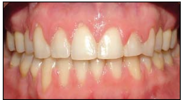
Fig. 2 Diastema eliminated using medium elastic power chain on .016" round stainless steel archwire.

Oral piercings can affect both oral and orthodontic health. 3-7 Body piercings carry considerable risk of initial local and systemic infections and of later cross-infection with pathogens such as hepatitis B and C, HIV, and herpes simplex viruses. 8-11 Body piercings are often performed without, or with poorly controlled use of, local anesthetic